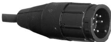
Cable to Cable