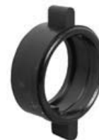
Winged Coupling Ring W/14482